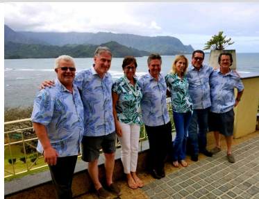
MCAC 2018/19 Board of Directors MCAC 163rd State Meeting March 4, 2019