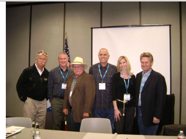
MCAC 2014/15 Board of Directors with Executive Director MCAC 153rd State Meeting January 21, 2014

Look how happy they look. This could be YOU!