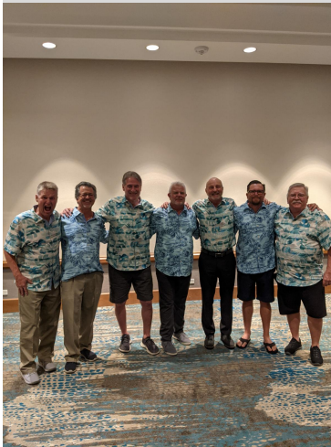
MCAC Current and Past Presidents at 60th Anniversary March 8, 2023

*Eligible Members - Contractor Members shall be voting members limited to one (1) vote per company or business.