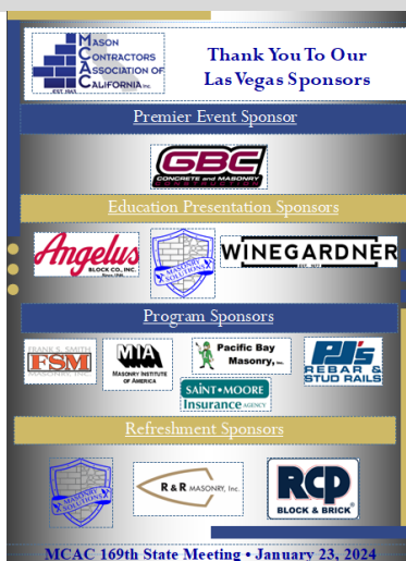
MCAC 169th State Meeting January 23, 2024 Sponsors